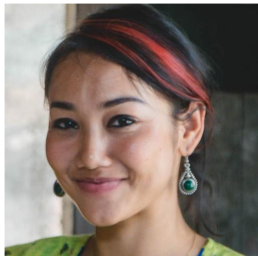
Coach of Eco-Poshak