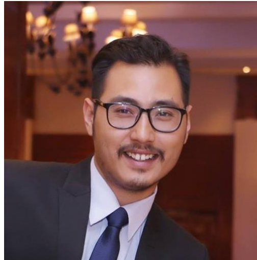
Coach of Botecden

He has a track record of working in a national consulting assignment to enhance productivity and scout opportunities for entrepreneurs and other beneficiaries. Currently, he is working as a Head of Operation at Clock B Business Innovations . He has also been conducting workshops in Soft Skills as a Learning Engagement Coach on behalf of Skill Lab . Overall, his role is mainly focused on facilitating young entrepreneurs.